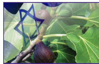
A fig tree of Israel https://shepherdschapel.com/@wordpress

Location: 1509 N. Dolores Rd. Hwy 145, Cortez Colorado www.byeshua.org