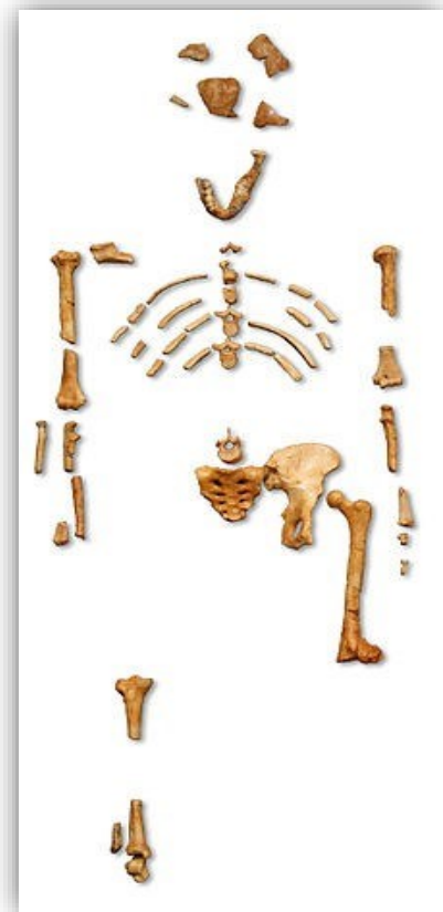
Australopithecus afarensis (Southern Ape)

From Left to Right: Figure 1. The skeleton that was actually found: Lucy Australopithecus afarensis (southern ape); Natural History Museum Vienna, Austria; Cleveland Museum of Natural History; Washington DC Museum of Natural History; London England; St. Louis Zoo; Answers in Genesis.